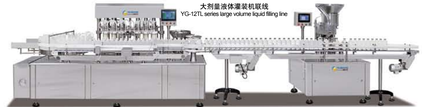
大剂量液体灌装机联线 YG-12TL series large volume liquid filling line